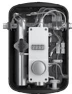
RTEX-08, RTEX-11, RTEX-13