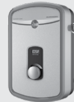
RTEX-08, RTEX-11, RTEX-13